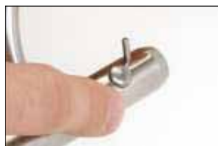
Hammer pin (No. 005070) in.