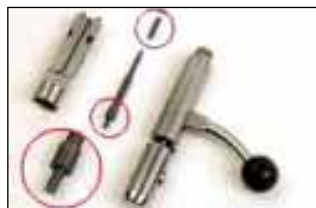
Disassembled bolt with new firing pin 1393-6/1 (No. 002827), firing pin spring 1393-11 (No. 002833) and compression spring (Nr. 009231).