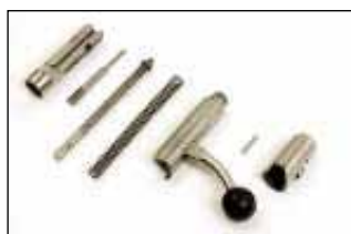
Disassembled old bolt assembly.