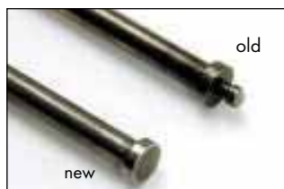
It is also possible to grind the old striker pin 1393-10/1 (No. 002831) down to the plane surface.