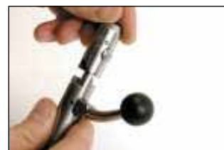
Insert the bolt assembly in the rifle in cocked condition.