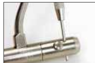
Remove the uncocked bolt from the rifle and hammer out the pin (No. 005070) in assembled condition.