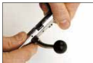
Cock bolt assembly.