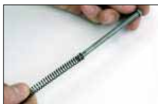
Insert striker pin in striker pin spring.