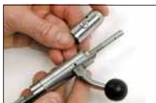
Remove cocking piece.