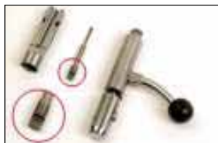
Disassembled bolt with old firing pin 1393-6 (No. 002826).