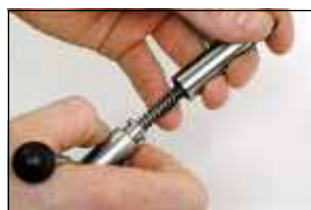
Carefully remove bolt head.