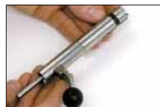
Lock bolt head on bolt with handle. Attention: Spring pressure!