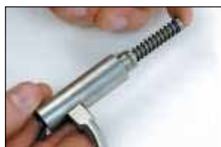
Insert striker pin in bolt with handle.