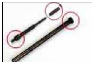
New firing pin with firing pin spring, new striker pin 1393-10/2 (No. 002832) and compression spring (Nr. 009231).