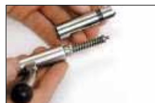
Disassembled bolt head.