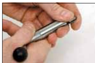
Carefully unlock bolt head. Attention: Bolt is under spring pressure!