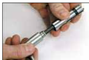
Press bolt head with firing pin on striker pin.