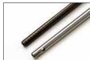
Drilled and undrilled striker pin.