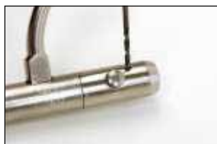
Drill hole through new striker pin (2.5 mm). The cocking piece must be uncocked.